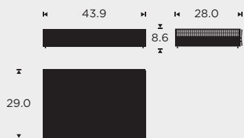
BeoSystem 4 with feet